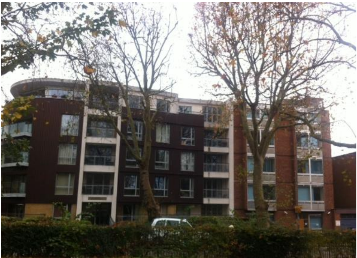
Photo 4: Near residential property to the east on opposite side of Highbury Grove